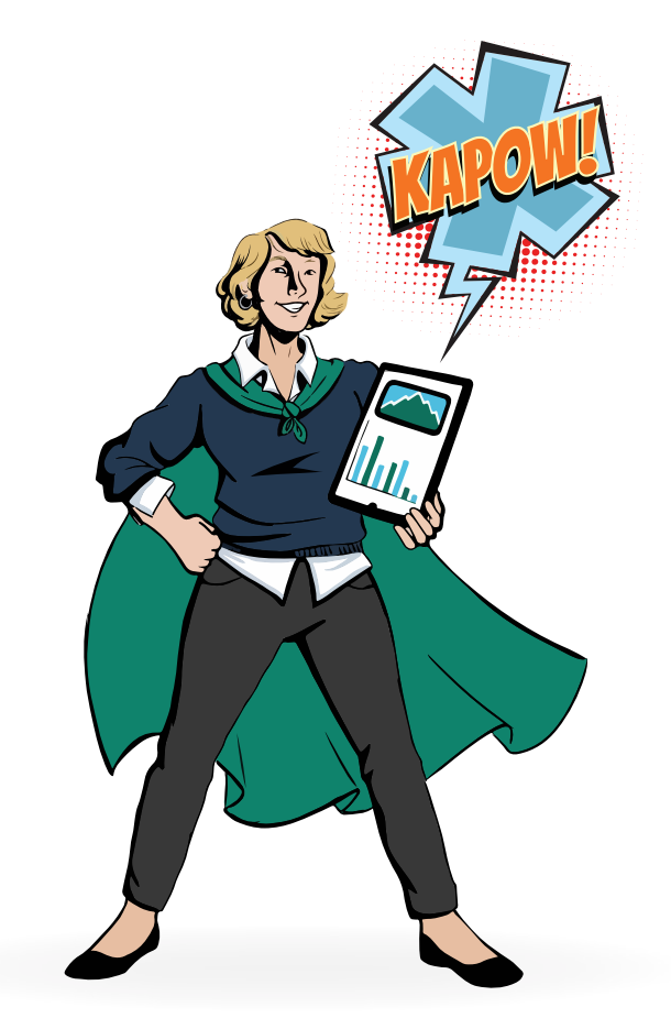
We've managed to soar above the chaos to bring you the reliability you depend on.