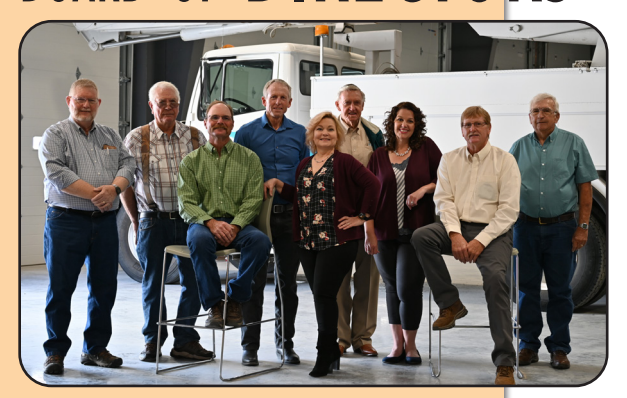
The masterminds behind the success of Mt. Wheeler Power